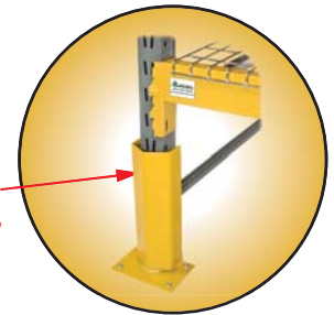
18 Inch Post Protector