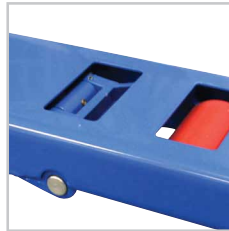
Powder Coated 3mm Metal Thickness Frame