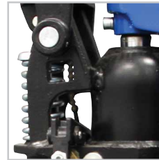
1 Year Parts Warranty