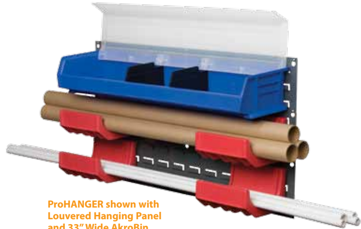
ProHANGER shown with Louvered Hanging Panel and 33" Wide AkroBin