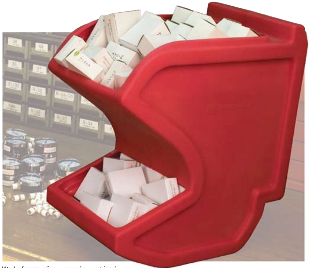
Works freestanding, or can be combined with the optional rack to create work cells or KANBAN stations