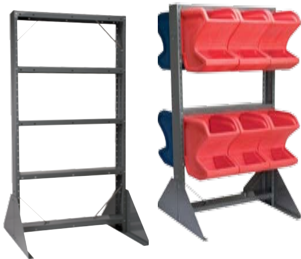
Double-Sided Gravity Hopper Rack Unit Model No. 31625RACK