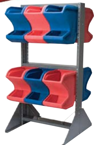
31625RACK holds 6 Easy Flow Gravity Hoppers per side (12 total) for maximum efficiency